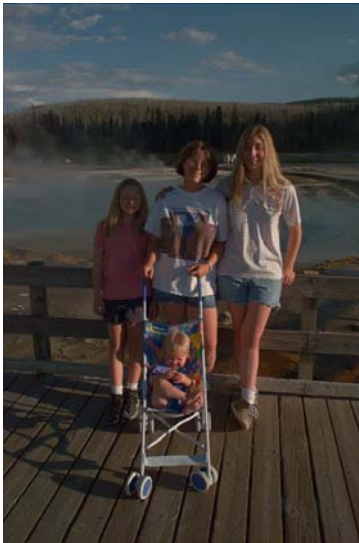
Scene referred image

set/gamma/luminance and ambient condition). Of course if the display is profiled and the data being previewed has an embedded profile, the sRGB file or any tagged file for that matter, will preview correctly in an application like Photoshop. Nonetheless, what is being seen, and ultimately output, isn't a colorimetric representation of the actual scene (scene-referred). This is one reason why producing "accurate" color from a digital camera can be difficult. Accurate is in quotes since nearly every user has a different definition of what they mean or want when they say accurate. It should be noted that this rendering and encoding process isn't necessarily limited to the process of creating images using digital cameras.